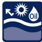
Sun Creams and Oil Resistance