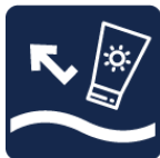
Resistance sun cream and oil