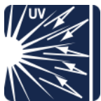
Excellent UV Protection