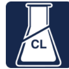
Ultra Chlorine Resistant