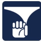
Four Way Stretch